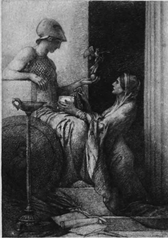
LELAND • STANFORD • JUNIOR • UNIVERSITY