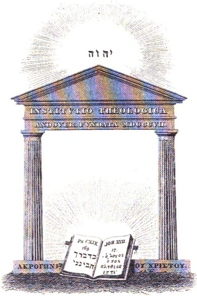
ANDOVER-HARVARD THEOLOGICAL LIBRARY MDCCLXX CAMBRIDGE, MASSACHUSETTS