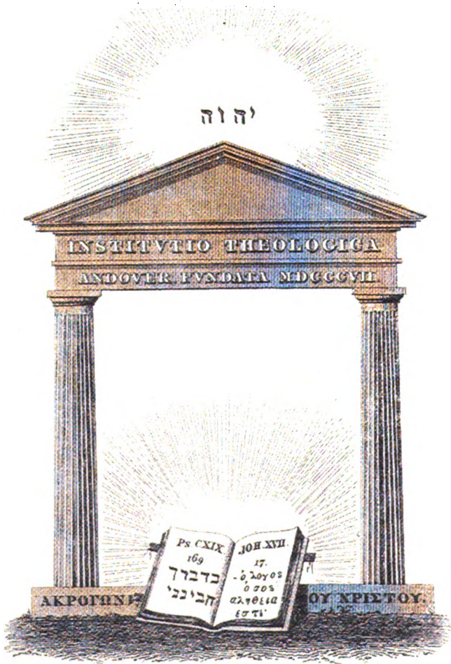
ANDOVER-HARVARD THEOLOGICAL LIBRARY MDCCCCX CAMBRIDGE, MASSACHUSETTS