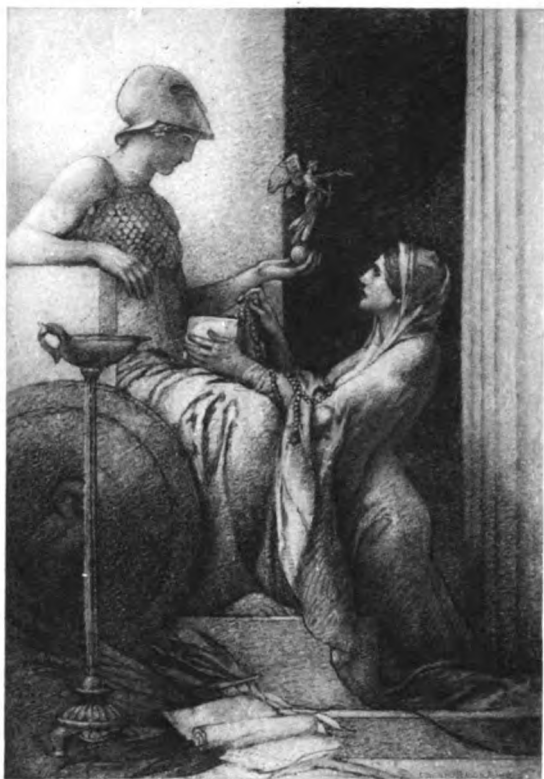
LELAND STANFORD JUNIOR UNIVERSITY